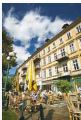
Schrópferplatz Bad Ischl