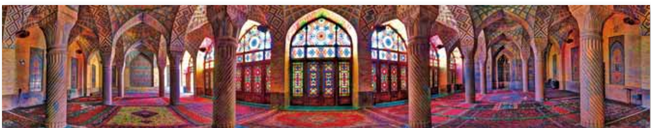
Nasir-ol Mulk Mosque © Mr.Omeed Aghaee