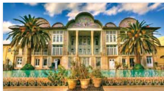
Eram Garden

But above all, Shiraz is rightly proud of its religious position in the country. Being called Sevvomin Haram Ahle Beyt in Iran (the third important religious city which house the mausoleums of the descendants of the holy Prophet of Islam), the city is an important tourism destination which offers natural, historical as well as religious must-see places to the visitors. Shiraz is also a major health hub, with a prestigious reputation for organ transplants within the Middle East countries and beyond.