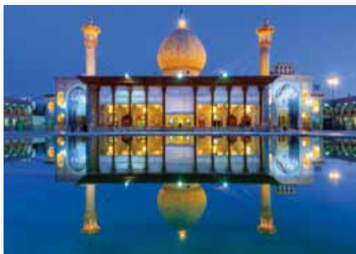
Shah Cheragh Mausoleum

As the mayor of Shiraz, I would like to take up this opportunity to convey my best wishes of health, peace and prosperity to all member cities and their citizens. Although it has not been long since we joined LHC, we are very eager and determined to become an active member. That is why we proposed to be host to the 2018 General Assembly. Like most other historical cities, Shiraz enjoys a wealth of tangible, as well as intangible heritage, which bring with them the question of how they can be preserved. How the -sometimes-seemingly irreconcilable approaches of development and preservation could be tackled is of course a great challenge. I hope that through exchanging knowledge and experience with other historical cities, we will be able to make better decisions for the future of our city. And, of course, if given the honor to be the next host, we will even have a higher chance of fulfilling our objectives.