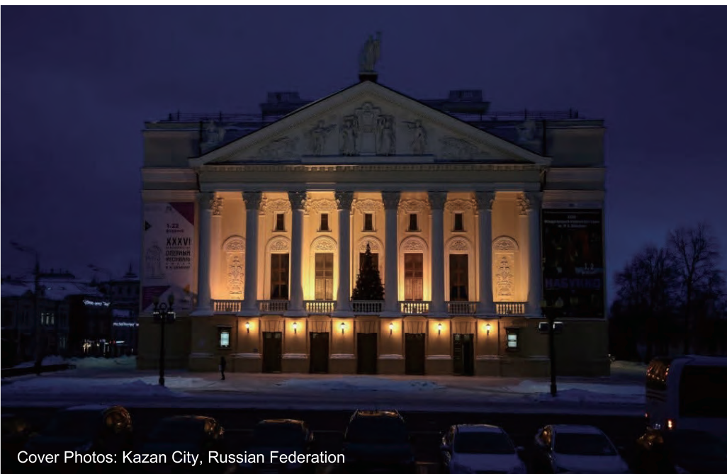
Cover Photos: Kazan City, Russian Federation