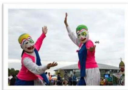
Andong, South Korea

The application forms and guidelines are to be posted on the LHC official website as well as the Andong Conference website soon. Application for each event will be accepted from June 1 to September 30, 2022. All submitted works will be exhibited at the conference venue as well as on the website. The awarded works will be announced at the closing ceremony of the 18 th World Conference.