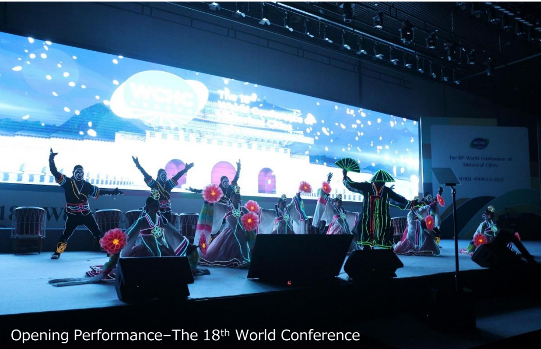
Opening Performance-The 18 th World Conference

Alexandria / Algiers / Fès / Giza / Luxor / Tunis