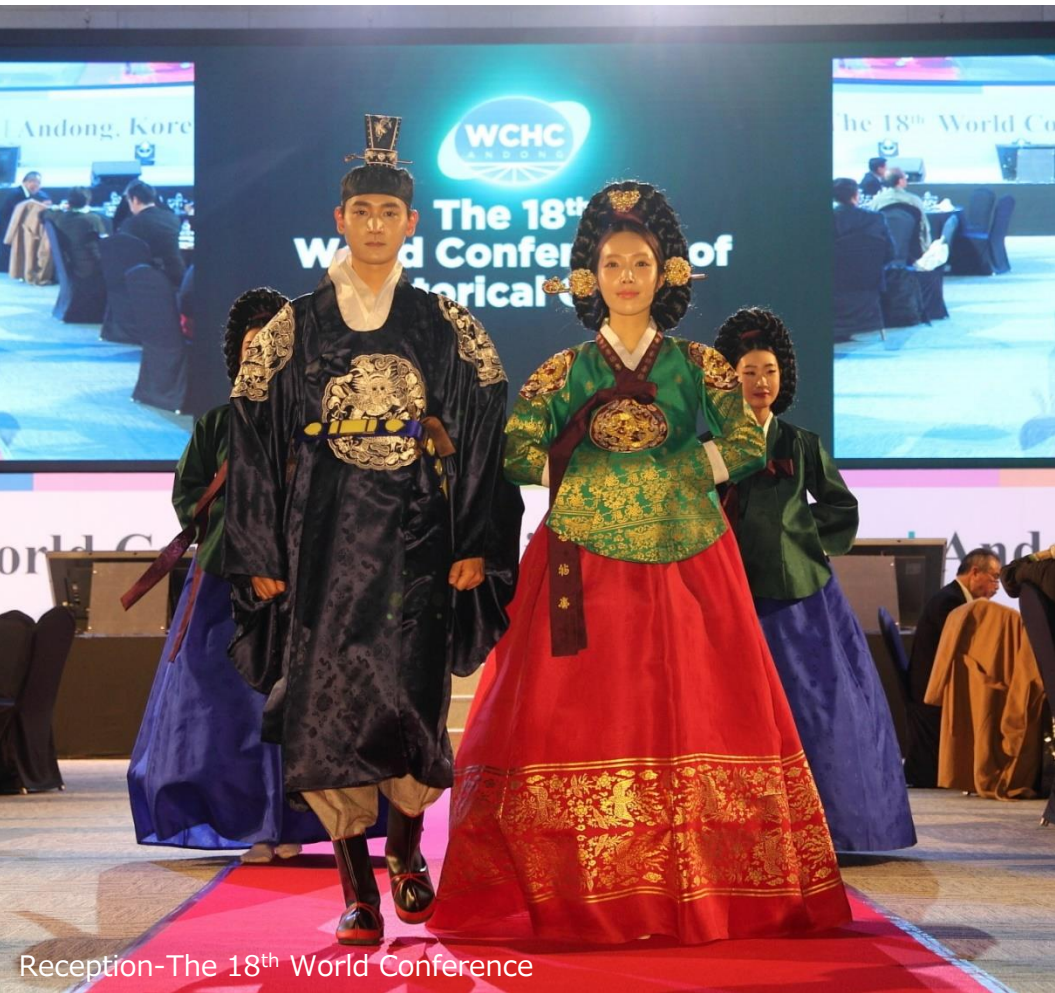
Reception-The 18 th World Conference