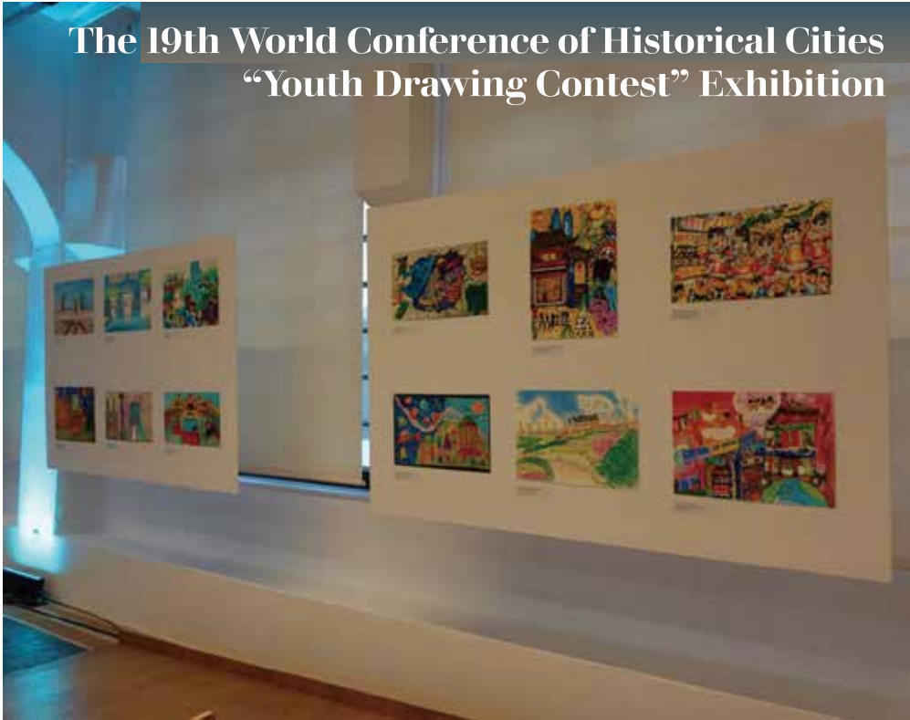
The 19th World Conference of Historical Cities “Youth Drawing Contest” Exhibition