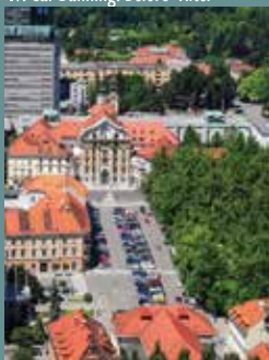
IV. Car Banning: Before - After

The City of Ljubljana used the rearrangement of public spaces and infrastructure as catalysts for the systematic renewal of surrounding historic buildings. Integration of urban planning, landscape design, and transportation planning has revitalized the city, which demonstrates that rearrangement and pedestrianization of public spaces are important drives for urban revitalization. Thanks to the initiatives, Ljubljana achieved remarkable results in a short period of time and its urban design including the works of Jože Plečnik was inscribed on UNESCO World Heritage list in 2021.