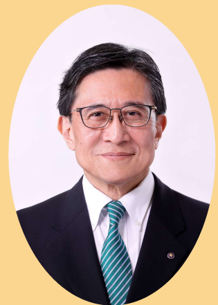
松井孝治 MATSUI Koji Chairperson of the LHC, Mayor of Kyoto