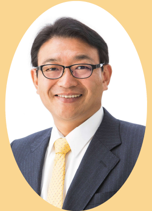
清元秀泰 KIYOMOTO Hideyasu Mayor of Himeji

Arcrea HIMEJI is a large-scale convention center that opened in 2021 as a hub for promoting social interaction and collaboration in Himeji City. The 20th World Conference of Historical Cities will be held in the Exhibit Hall, with a viewing space for audience members set up in the Medium Hall. Located in the heart of the city, home to the World Heritage Site Himeji Castle, Arcrea HIMEJI serves as a center for cultural exchange and academic dissemination, providing a suitable venue for the 20th Conference.