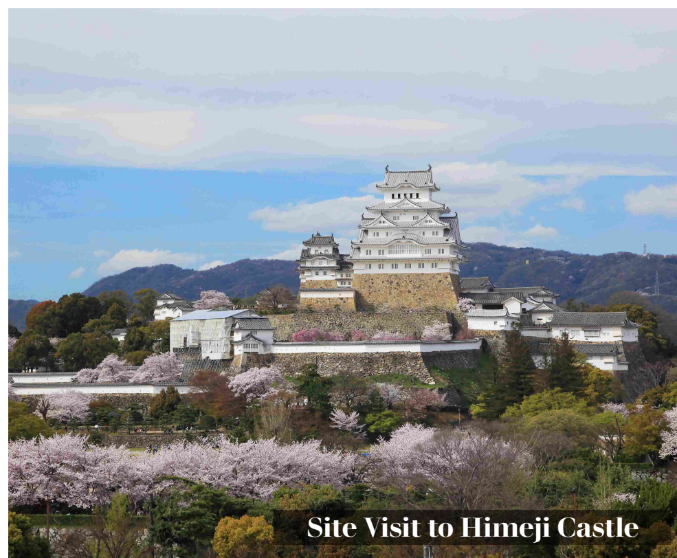
Site Visit to Himeji Castle