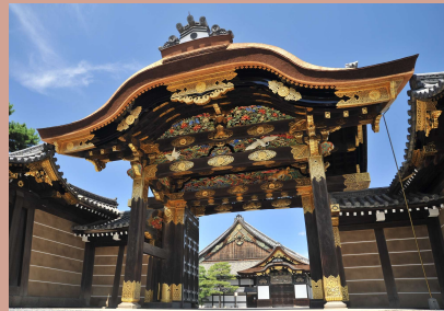
Kyoto City Nijo-jo Castle Office

Nijo-jo Castle has witnessed some of the most important events in Japanese history in the 400 years since it was built. The castle was completed in 1603 on the orders of Tokugawa Ieyasu, the founder and first Shogun of the Tokugawa Shogunate (1603-1867). Tokugawa Ieyasu unified Japan after a long period of civil war, and ushered in a period of over 260 years of peace and prosperity. The government that Ieyasu established lasted for fifteen generations, and was one of the longest periods of stability and prosperity in Japanese history. The 400-year-old buildings of the Ninomaru-goten Palace, the Kara-mon Gate and the Ninomaru Garden, are unique survivals from one of the golden ages of Japanese architecture and design, the early Edo period, known for its ornate architecture and magnificent interiors.