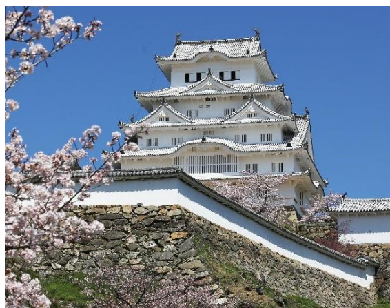
Himeji host the 20th Conference in 2026