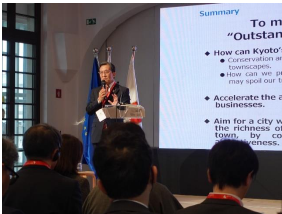
Round Table I